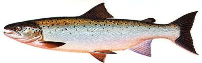
Landlocked Atlantic Salmon

Several activities are currently ongoing or planned within the watershed. Classroom hatcheries have been set up in Halton Hills, Georgetown, Mississauga and Brampton. Students from kindergarten to grade 12 have the opportunity to raise 100 Atlantic salmon. Yearling Atlantic salmon will be stocked this spring in Terra Cotta and Inglewood, and fry will be stocked at the Forks of the Credit River, Belfountain and Black Creek. The program will also support works to create a bypass channel around Wolfe Lake in Terra Cotta to supply cold water to the Credit River.